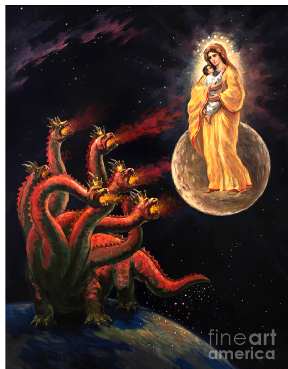
PHOTO: Dragon and Woman