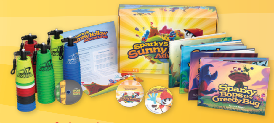
Order today at awana.org/SparkysAdventures