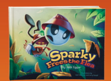
Obedience — Ephesians 6:1