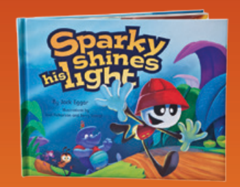
Thankfulness — Matthew 5:16

Buy your copy of Sparky Braves the Big Bees today at awana.org/store