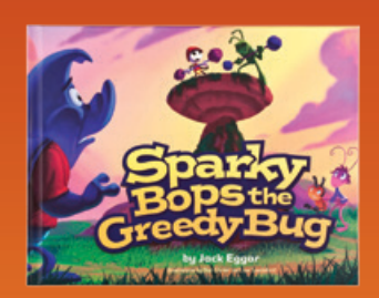
Generosity — Philippians 2:3